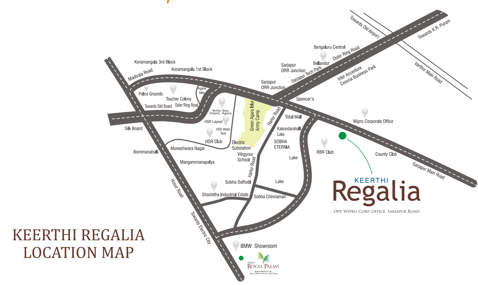
KEERTHI REGALIA LOCATION MAP